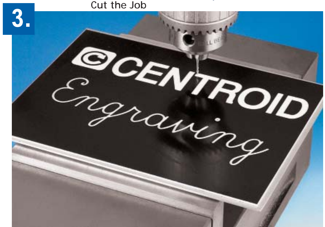
Cut the Job