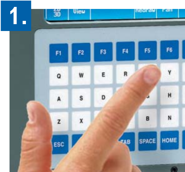
Type in Letters