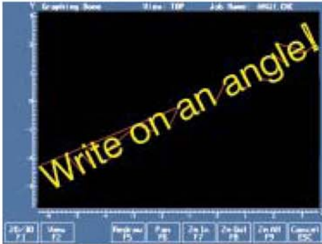
Engrave on Any Angle