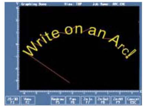
Write Text Along An Arc