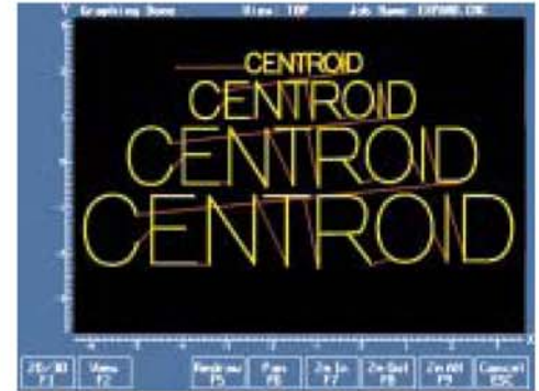
Scale Text to Any Size