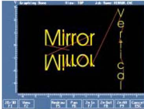
Mirror Text or Write Vertically