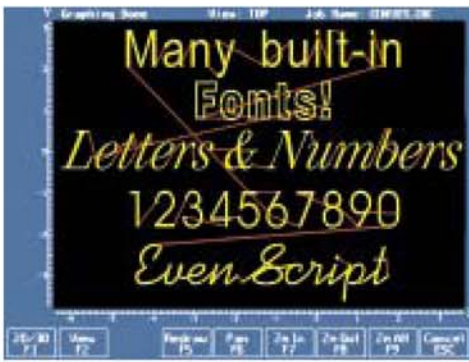
Includes Many Built-In Fonts